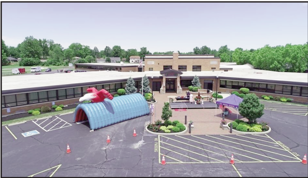
Class of 2020 Drive-Through Diploma Pick-up