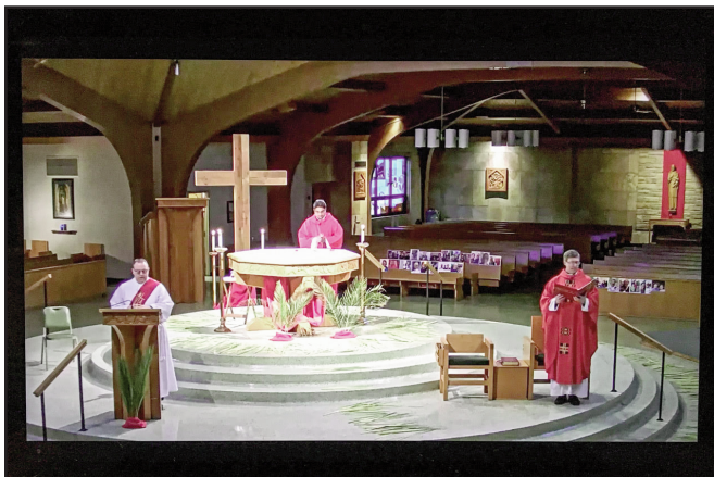
Palm Sunday Mass April 5, 2020

In the first weeks without a congregation, parishioners were invited to send electronic photos of themselves and their families to the parish and "fill the pews." Printed photos were then displayed in the pews of the St. Charles section as reminder to all of those praying along at home.