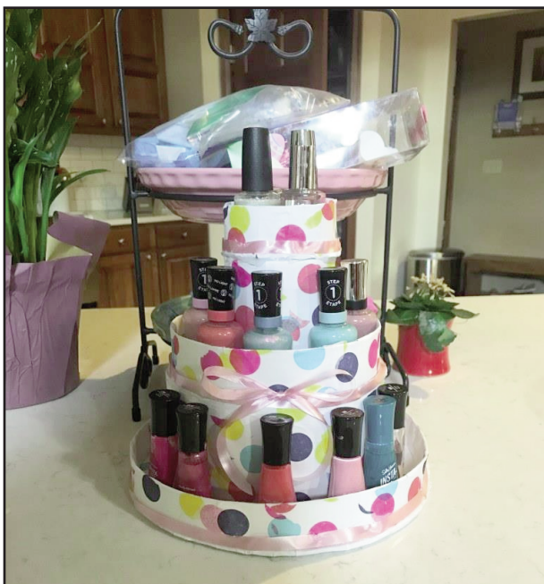
Nail Polish Holder

Cardboard is a versatile material that can be cut, bent, painted, wrapped, and configured in almost any way imaginable. Whether purely just for fun or to create something practical, students up-cycled their cardboard and gave their packaging a new purpose!