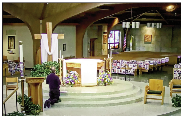
Fr. Kent leads the "congregation" in the rosary prior to the 8:00 a.m. mass - May 17, 2020

As we go to press for this special issue of the Chimes, our Masses have reopened to the public, but the bishops' dispensation from the Sunday Mass obligation continues. Masks are encouraged and many changes to the liturgy are in effect. The Precious Blood is not being offered to the congregation at this time. The Sign of Peace gesture has been suspended. Hymnals have been