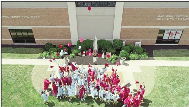
LCC Class of 2020