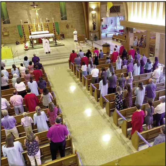
Class of 2020 Baccalaureate Mass