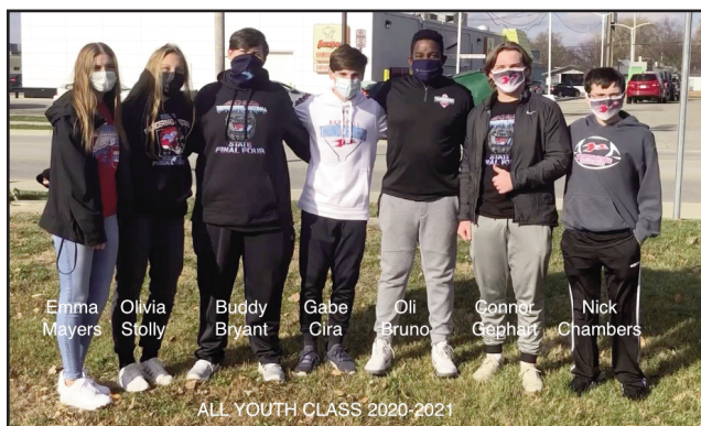
ALL YOUTH CLASS 2020-2021