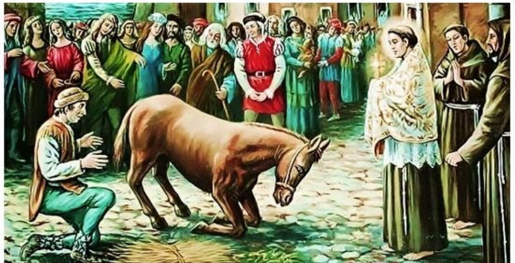
Milagro de la Mula que adoró al Santísimo, año 1227

Mules are bullheaded and stubborn, but even a mule could see that his creator was the most important thing to him. Are you the man or the mule?