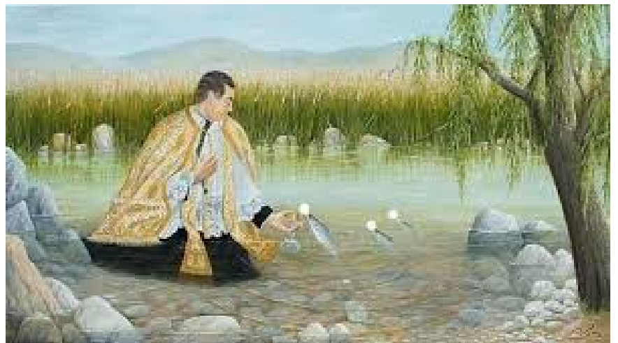
Eucharistic Miracle Alboraya-Almacera, Spain | 348

When you go to Mass and see Father hold the Host up for everyone to see, do you acknowledge that that little white wafer is really the body, blood, soul, and divinity of Jesus? And that He took this form because He loves you?