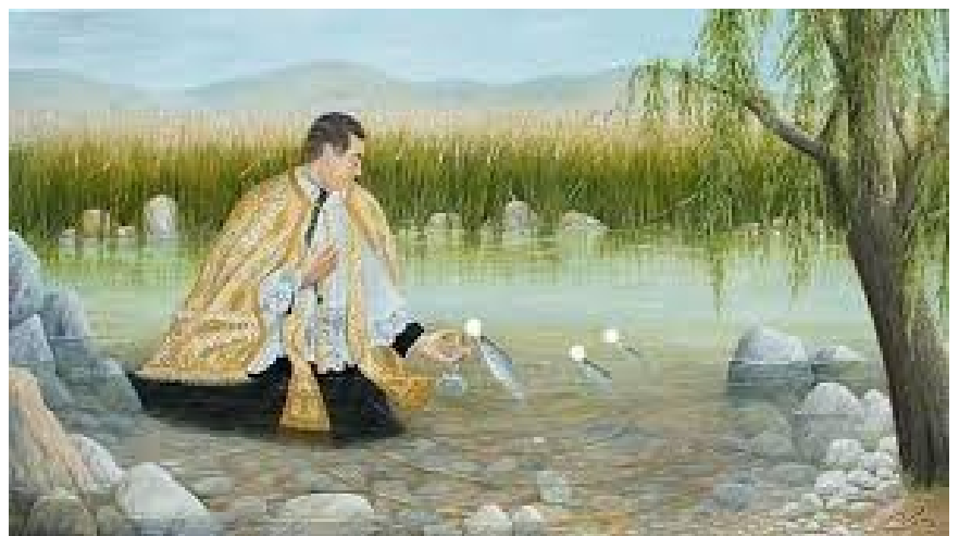
Eucharistic Miracle Alboraya-Almacera, Spain | 348

When you go to Mass and see Father hold the Host up for everyone to see, do you acknowledge that that little white wafer is really the body, blood, soul, and divinity of Jesus? And that He took this form because He loves you?