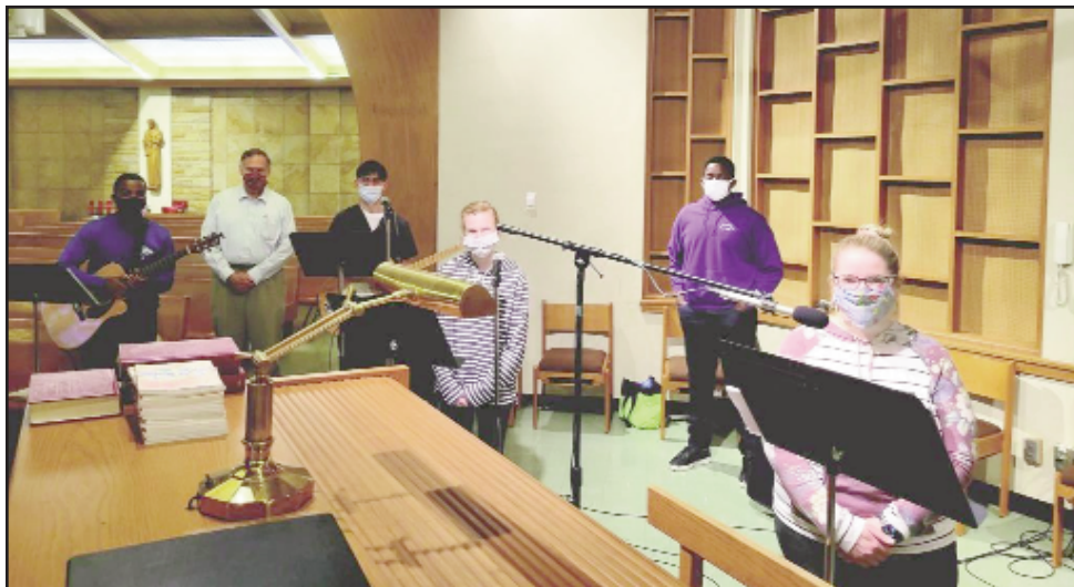
The Life Teen Band at our Last Worship Night on 4/14

At our first Life Night, the teens let us know that Adoration, praise and worship, singing and dancing were high on their list of what they would like to see happen this year. With this in mind we started our Worship Nights featuring a testimony, praise and worship music, and most importantly Adoration and Benediction of the Blessed Sacrament. We had four Worship Nights throughout the school year and I would like to thank all those who attended for joining us in spending time adoring and praising Jesus.