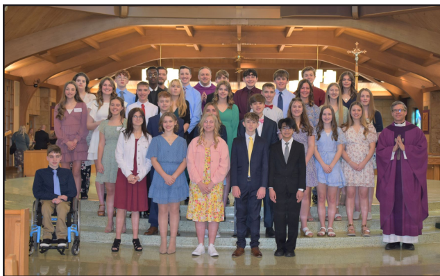
RCIA Confirmation Class of 2022

This year, we Confirmed 31 of our 8 th graders and 3 high school students to become full members at our Easter Vigil. First, I want to say congratulations to all of the youth who have become full members of our family this year. We have some amazing young people with a variety of talents and I can not wait to see where God takes them. A couple of them are also considering the religious life, which I think is amazing.