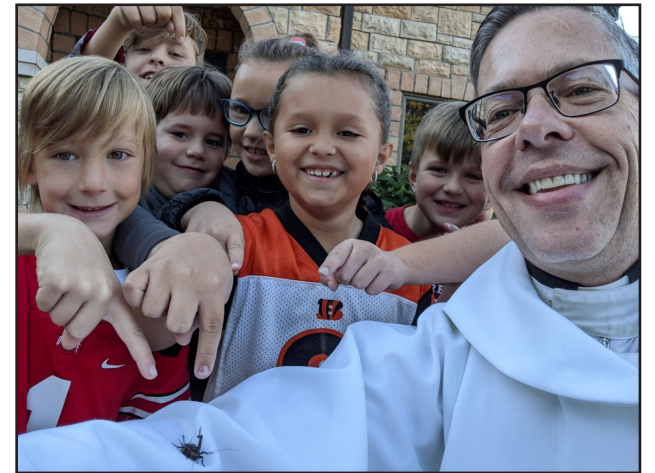
On St. Francis Day, Oct 4, a cricket decided to come to Mass, but afterwards we set him free back outside!