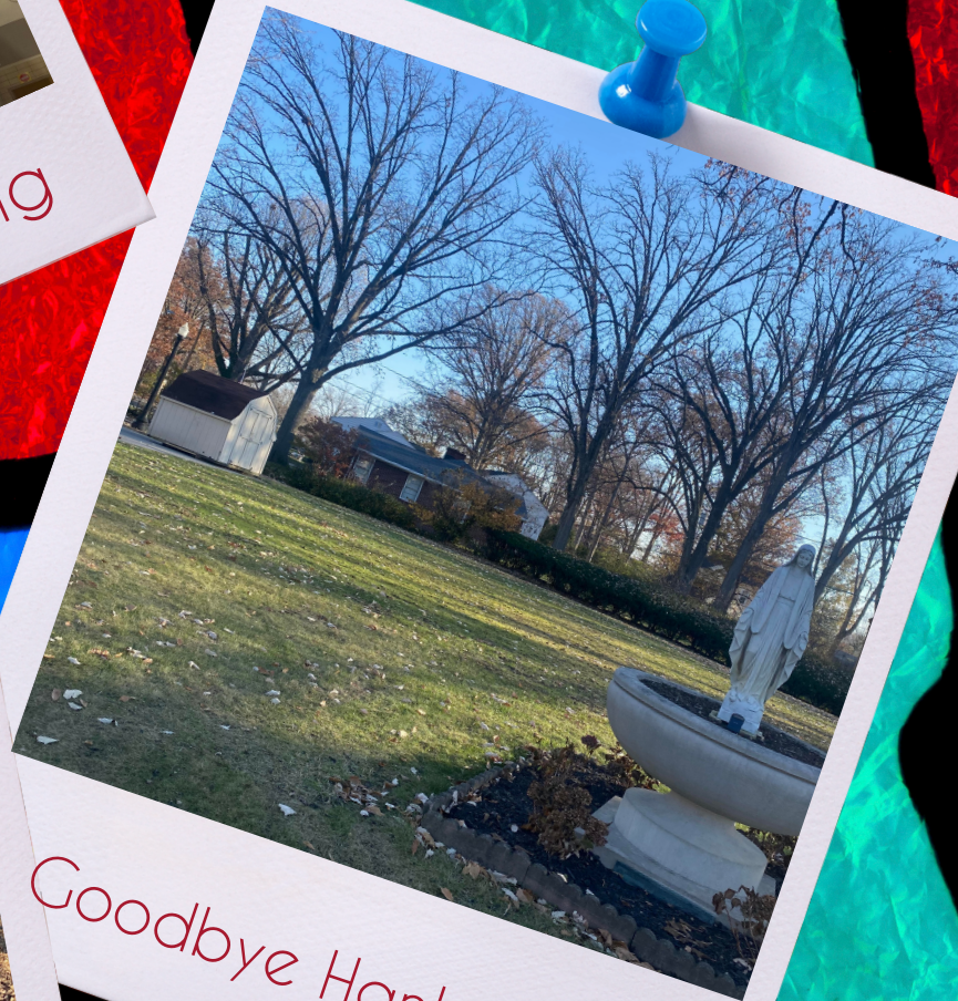
Goodbye Hanley House