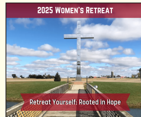
Retreat Yourself: Rooted in Hope