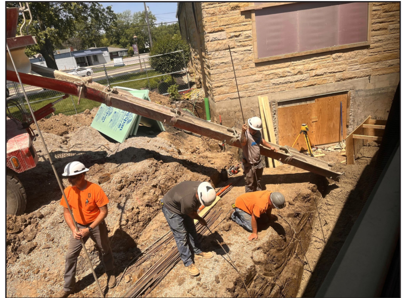
Elevator Project Begins — Construction is underway! Equipment and materials have begun arriving on campus as work starts on the long-awaited elevator project.