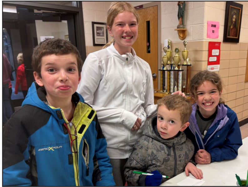
The Miroglio students entering for a chance to win the raffle basket at the art show held on May 5th.